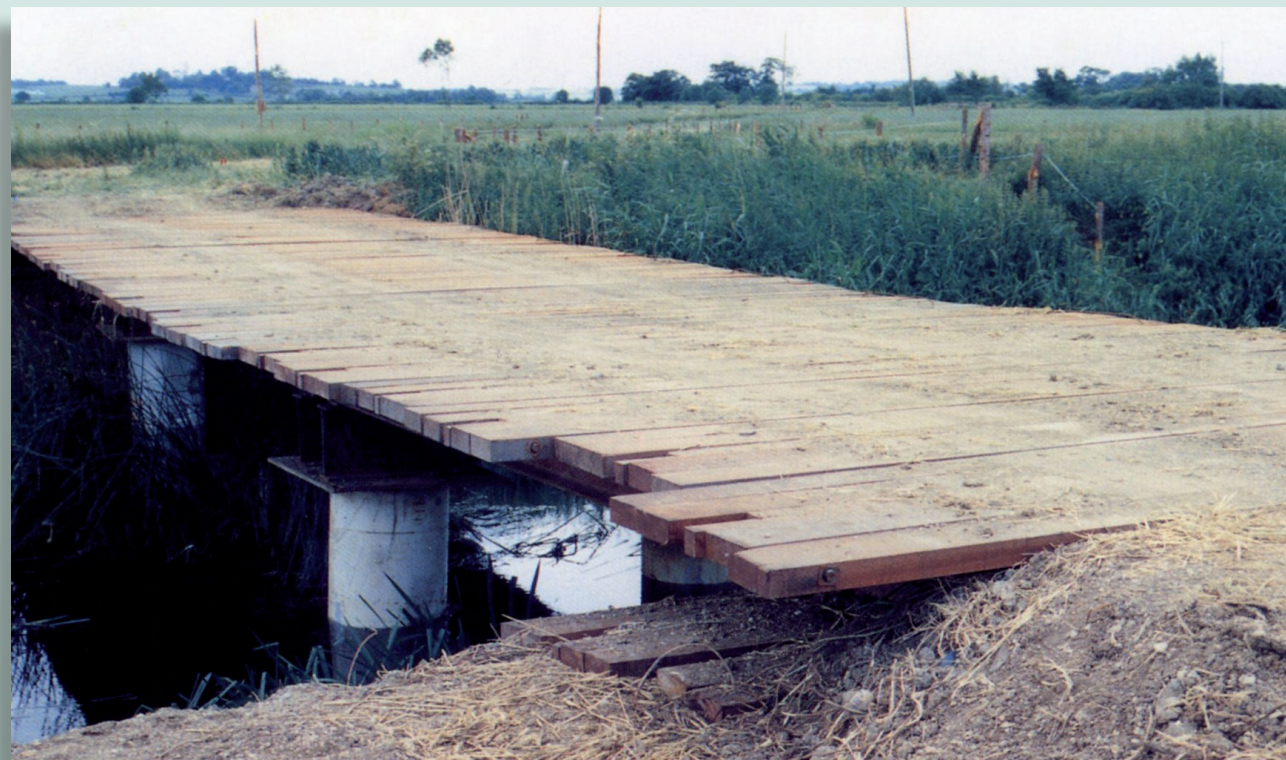
▲ Temporary bridge for pipeline contract - Calne, Wiltshire