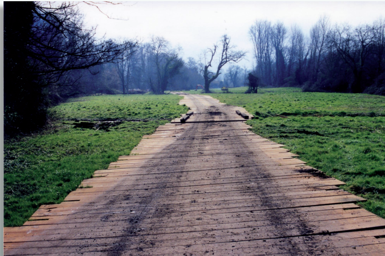
▲ Temporary access and bridges across Itchen flood plain, Southampton.

sections, temporary bridges, crane outrigger mats, crossing timbers and sleepers.