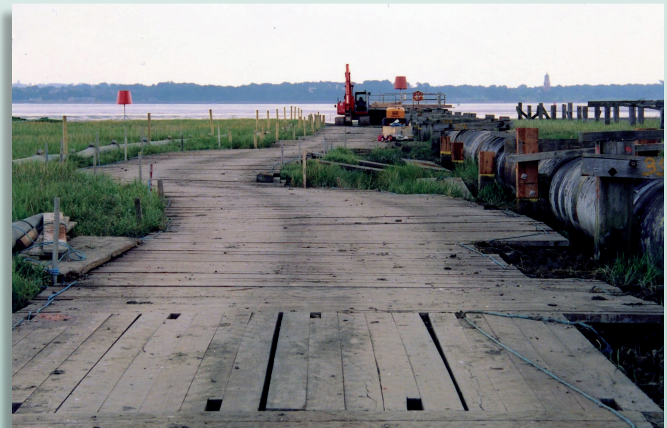
▲ 650m Temporary Access for sea outfall at Southampton Water

5m x 1m x 100mm, 150mm, 200mm and 300mm Hardwoods Mats for where the area may be waterlogged or particularly unstable and heavier machinery requires a firmer base from which to work off or gain access to.