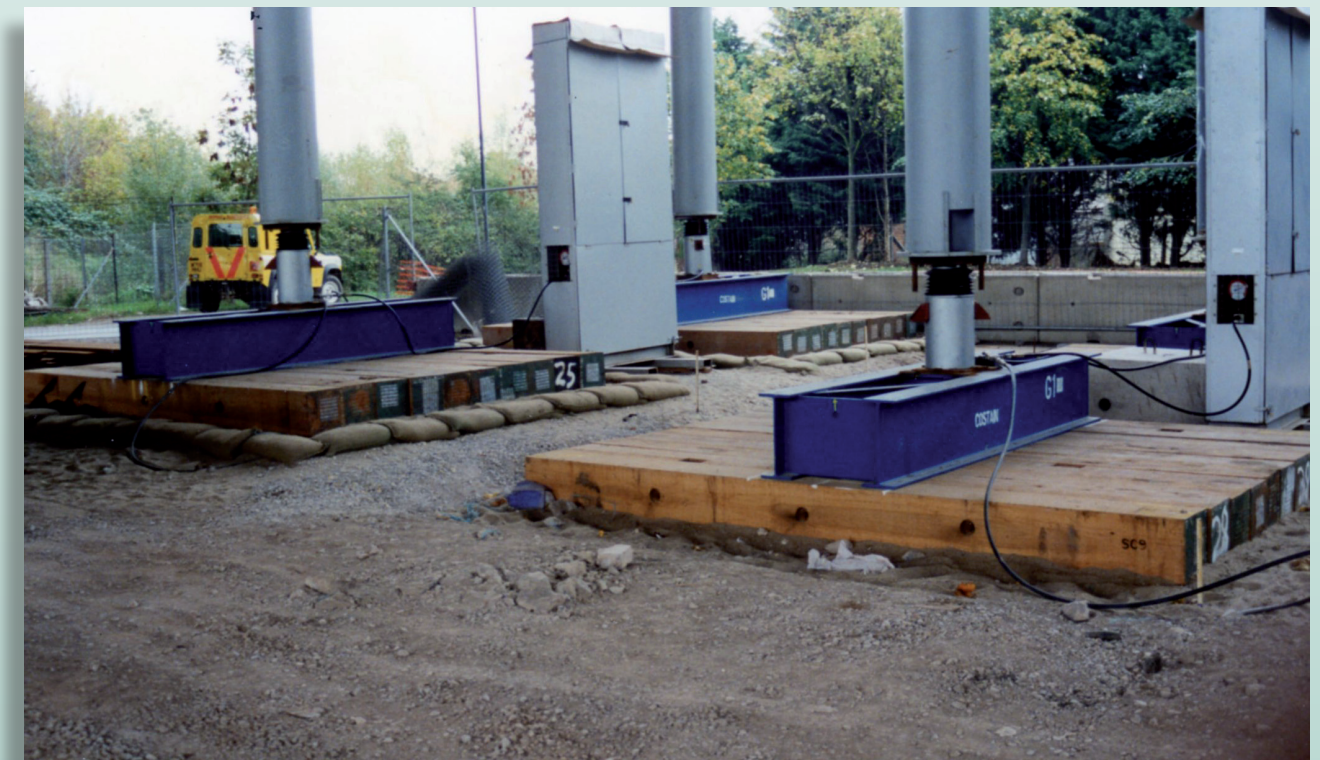
▲ 4m x 1.5m x 300mm Greenheart Mats under jacks supporting the Avonmouth Viaduct M5 Motorway