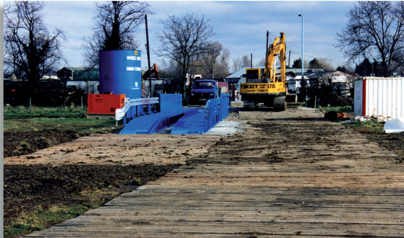
▲ Access to and from Wheelwash - Bedfont, Middlesex

prime requirement. For this reason it is ideal for all forms of marine work i.e. piling, sea defence, groynes, jetties, beach landings and slipways, access roads , decking, working platforms, temporary bridges and onshore drilling sites.