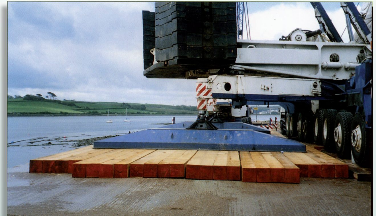
▲ 300mm Crane Mats as outrigger pads under 1000 tonne Telescopic mobile at Appledore, Devon

bearing pressure and preventing damage to existing hard surfaces or protecting underground services.